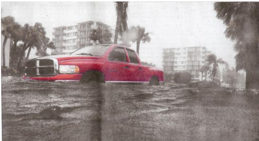
Truck boating on Siesta Key

rivers and back to streets. Siesta, Casey, Lido, Anna Marie and the other barrier islands did not fare as well. Boats tried to access Marina Jacks and an unoccupied building on Main Street collapsed. In Tampa they water skied in the streets and further east they got twenty-five inches of rain. Sarasota is still in a rain pattern with somewhere around ten inches already measured. The sun is out right now and we are hoping for much more of that.