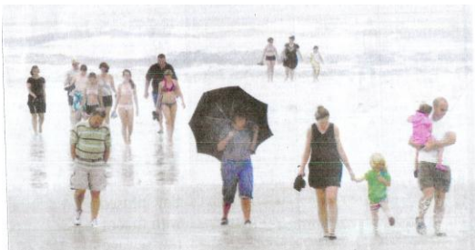
It's a #1 beach no matter what