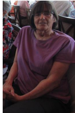
Lynda – photographer